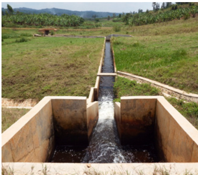
^ The main channel taking water to the catchment. > A technician regulating the amount of water leaving the dam.