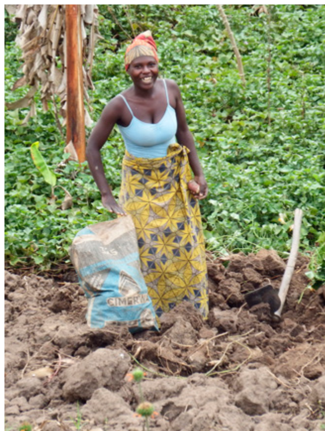
Cattle grazing near the main irrigation channel, and a farmer preparing land for planting vegetables, showing the diversity of water users and uses in the catchment area.

Eugene Kalisa President of the Rwangingo rice growers cooperative