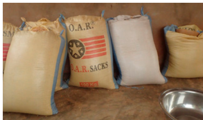
Dambélé Ouandé dries maize flour on tables in the courtyard of her house.