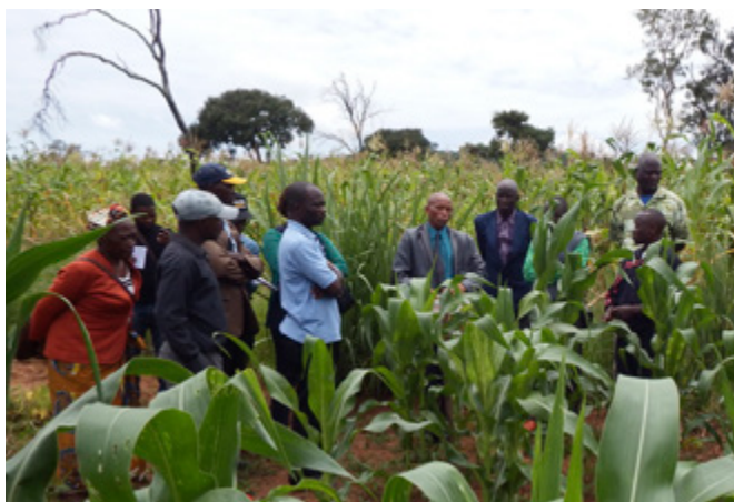
Cooperative members sharing experiences on growing maize for seed, and the pests and diseases that affect production and seed quality, during a visit to one of the farmer’s fields.