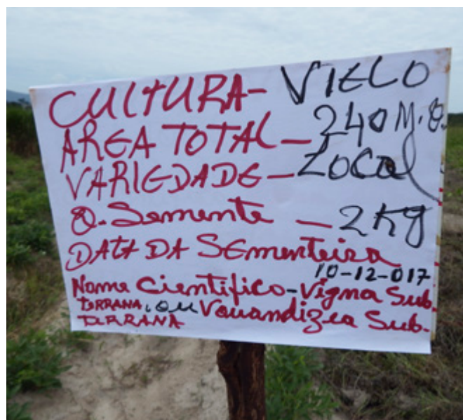
The group multiply selected improved seed varieties on special plots

A group of farmers began to work together to produce quality seed in 2012, starting slowly, with the original aim of building up a seed bank for their own use. Then in 2015 they established the Sementes do Planalto seed cooperative, with the support of the non-governmental organisation (NGO) CODESPA, in part to enable them to access credit. The lack of funds was a serious constraint to development. But then, with credit, they began to produce much more and started to seed, and grew... Based in Bailundo, there are now 200 active members spread across seven municipalities in the provinces of Huambo and Bie. All members demarcate a certain area that they dedicate to the production of selected varieties, mostly of maize and beans, with the benefit that the cooperative guarantees to buy all seed they produce at an agreed price.