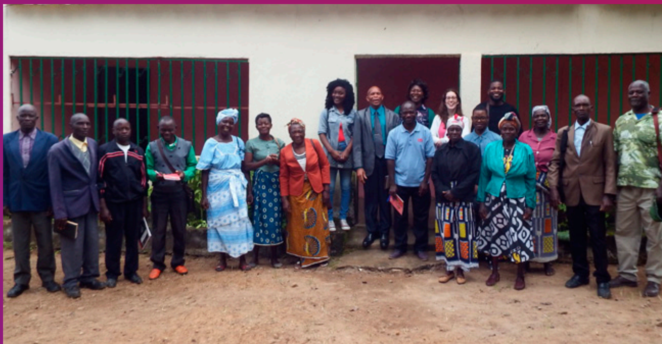
The innovation partnership has the full support of the municipal government, where the initial capacity needs assessment was held, and the seed cooperative meets regularly at their main office.

employment. Nonetheless, by the start of 2018 the action plan was validated and a clear plan for implementation of activities was put in place. These include support so that the cooperative can find and hire an agronomist to provide appropriate technical assistance, to collate a list of all the potential input suppliers and purchasers of seed in the area, to train members in how to prepare business plans so they can access credit and better manage their affairs, and to assist in the provision of capacity building in internal management and organisation.