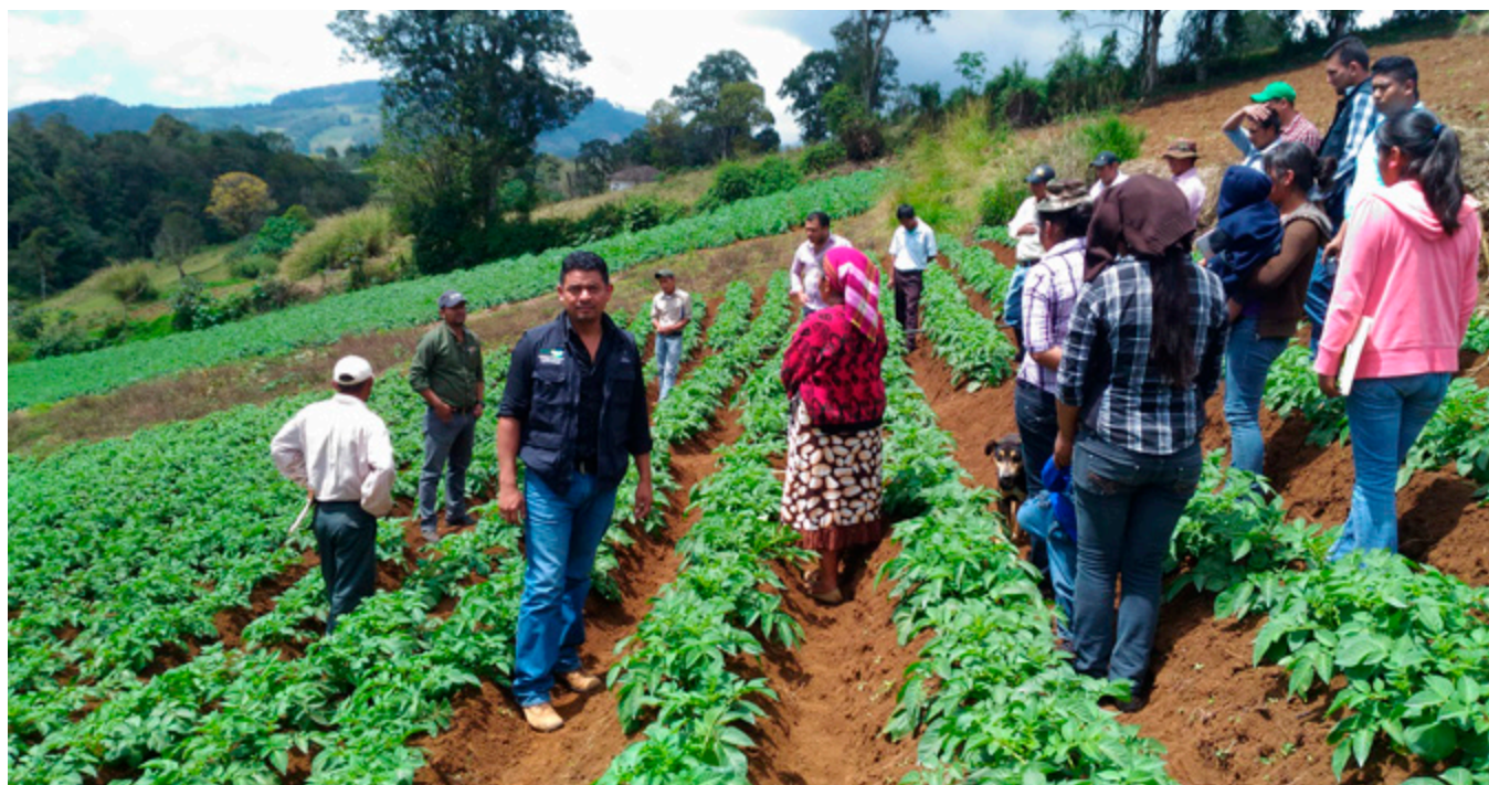
Potato stakeholders receiving training in good agricultural practices as a result of links made through CDAIS, and also making good use of the opportunity to share experiences among themselves.