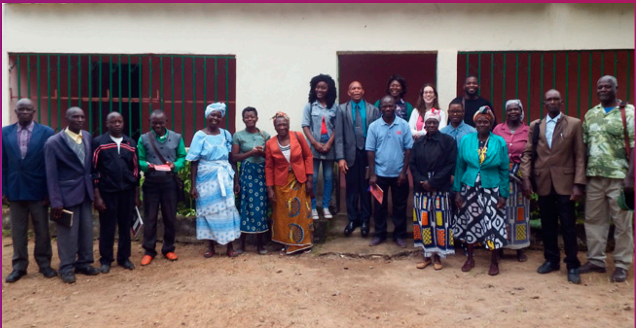
The innovation partnership has the full support of the municipal government, where the initial capacity needs assessment was held, and the seed cooperative meets regularly at their main office.

employment. Nonetheless, by the start of 2018 the action plan was validated and a clear plan for implementation of activities was put in place. These include support so that the cooperative can find and hire an agronomist to provide appropriate technical assistance, to collate a list of all the potential input suppliers and purchasers of seed in the area, to train members in how to prepare business plans so they can access credit and better manage their affairs, and to assist in the provision of capacity building in internal management and organisation.