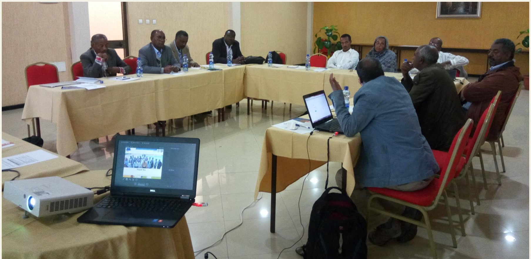
Participants at the CDAIS capacity needs assessment workshop.

The ‘capacity needs assessment’ for the livestock feed safety and quality innovation niche took place over three days, on 28-30 March 2017. It involved the active and intense input of 15 key stakeholders, including farmers and dairy producers, feed traders, associations, and policy makers. It introduced new concepts and tools such as the ‘problem and solution tree’, the ‘net-map’, and the ‘visioning’, opening participants’ eyes to different ways of seeing issues and identifying the most effective ways forward.